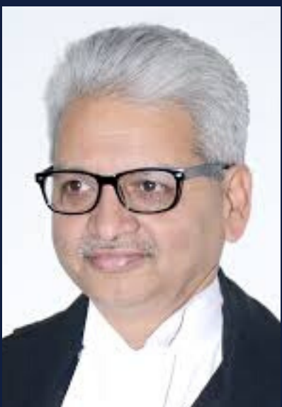
Justice A.P.Sahi, Chief Justice, Madras High Court